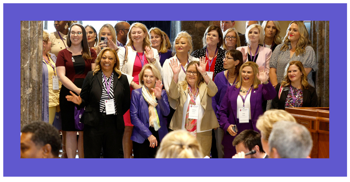
Photo: Ellevate Louisiana members being recognized by the Senate during the 2023 Legislative Session