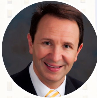
GOVERNOR JEFF LANDRY